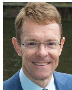
Andy Street, Mayor of the West Midlands

Working together, we have the opportunity to prevent and design out homelessness.